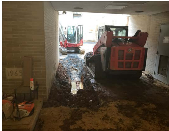
Demolition in Courtyard