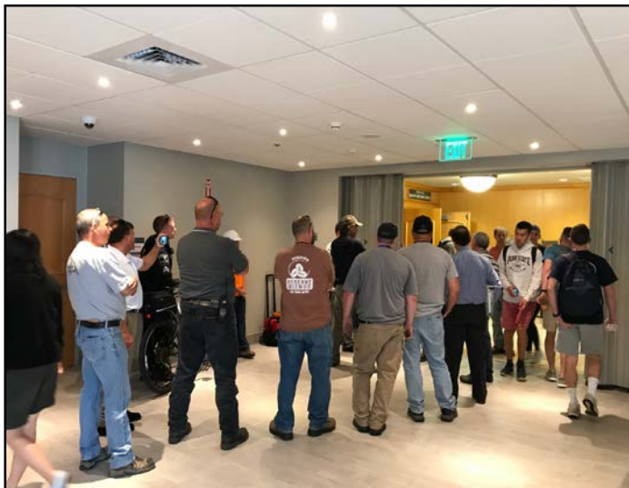
Won Door Training