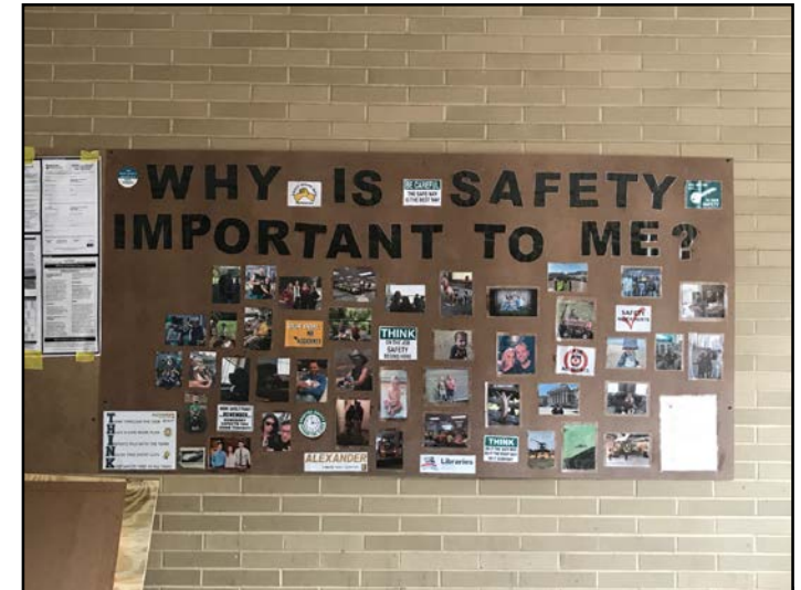
Why Safety is Important Board on Site