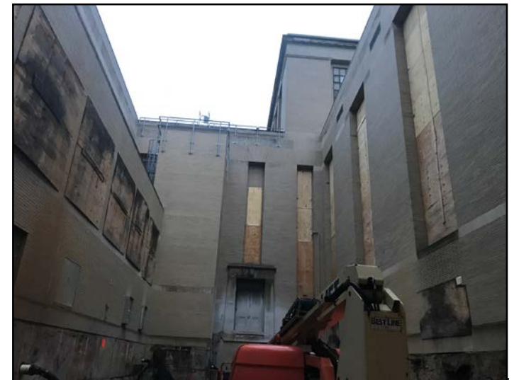
Additional Temporary Window Protection