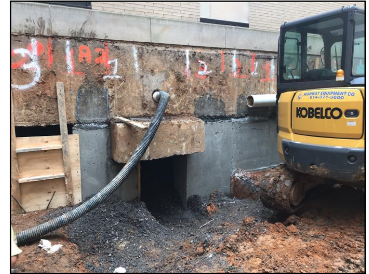
Re-routing Existing Storm Pipe