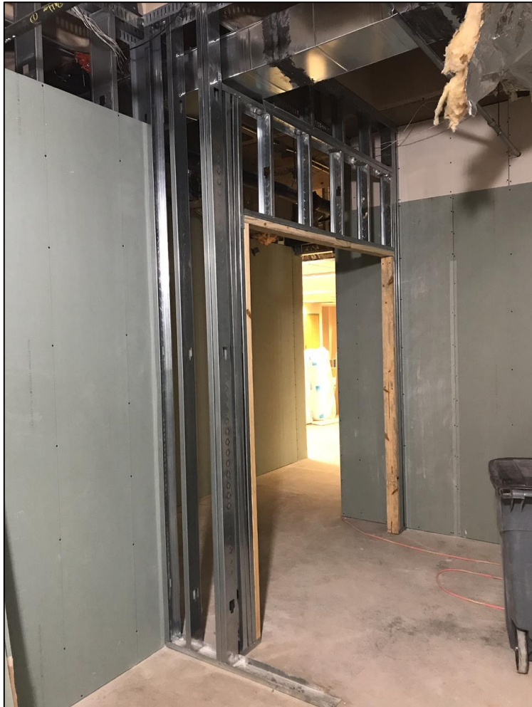
Egress Framing Modifications at Paterno