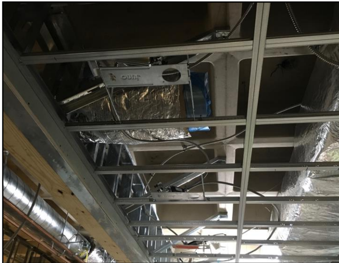
Lighting Fixture Rough-Ins at Paterno