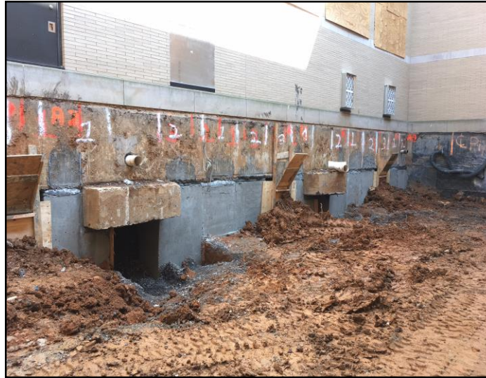
Underpinning Nearing Completion